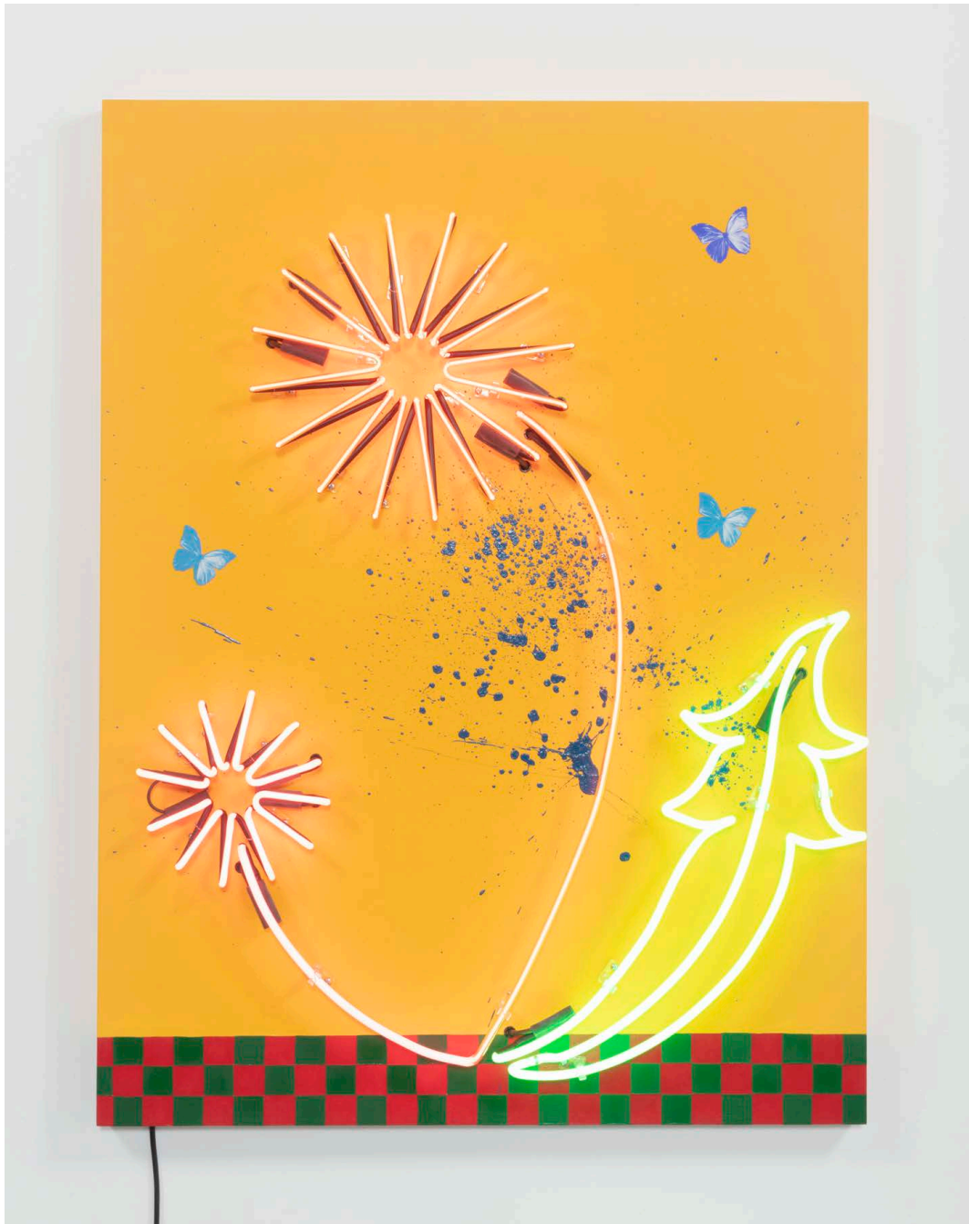
Dandelion , 2022, Oil paint, glass, electrical transformers, noble gasses, screen print on paper mounted over wood panel | 48" x 36" [HxW]