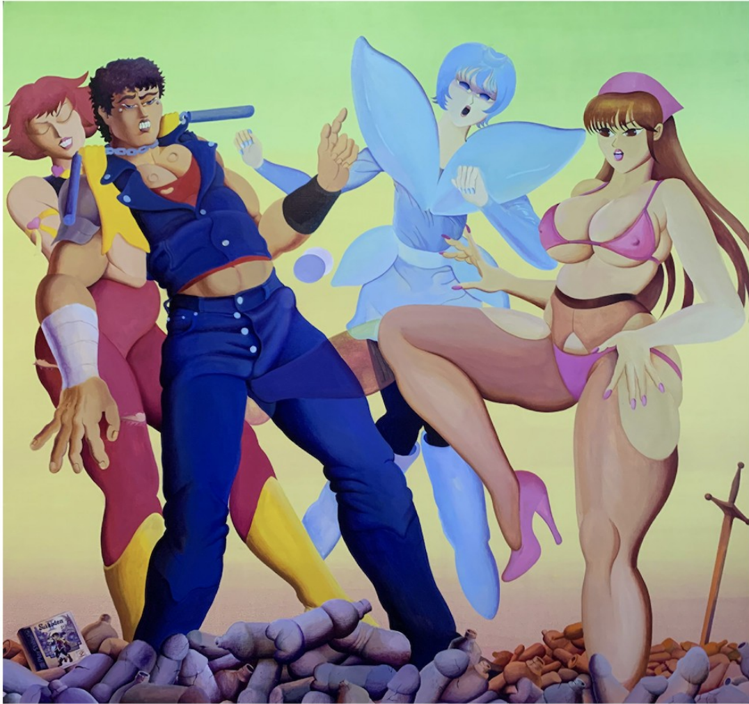
Jonny Negrón Stars of Destiny, 2022

acrylic on linen 72" x 64" x 1 ½" [HxWxD] (182.88 x 162.56 x 3.81 cm) #JO1000